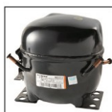
Global famous compressor