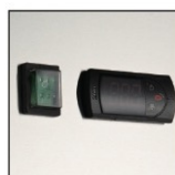
Global famous controller