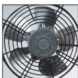
High quality fan